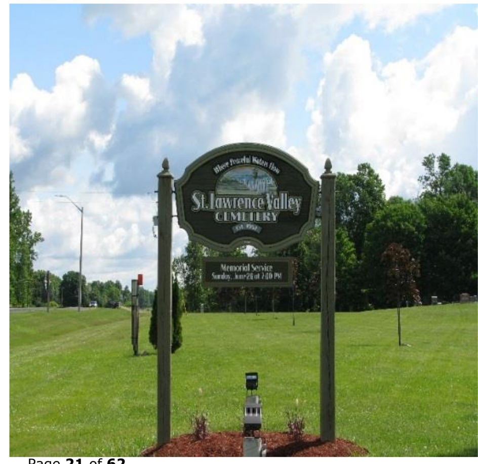
Page 21 of 62

relocate houses, another concern was the existing Cemeteries in these soon-to-be flooded villages. After deliberation took place about how to relocate the Cemeteries, the St. Lawrence Valley Cemetery was created in 1960 and quickly filled plots as numerous graves and headstones were moved before the flooding took place. Today, you can still see